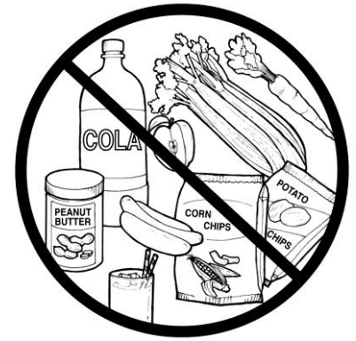
Picture 3 Do not give your child these foods.

All foods should be cut and chewed VERY well. If your child's doctor allows it after the first 2 weeks following surgery, you may add other foods a little at a time. Ask your child's doctor before making any changes in his or her diet!