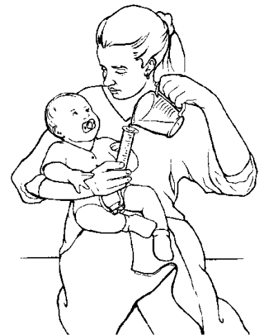
Picture 4 Sometimes the G-tube is used for feeding.