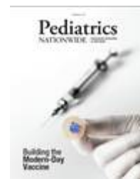
Fall/Winter Issue of Pediatrics Nationwide

Video Game Technology Can Help Measure Upper Extremity Movement in Children with Muscular Dystrophy : Developed by researchers at Nationwide Children's and designed with input from patients,