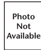
Vacant Children's Homecare Medical Director