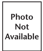
Vacant Partners for Kids Medical Director