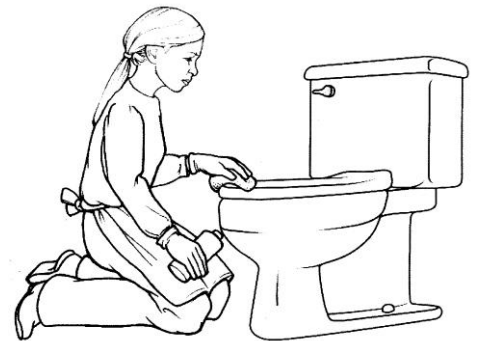
Picture 2 Clean the bathroom every day.