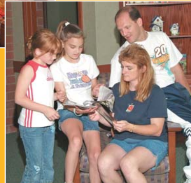
Siblings of hospitalized children often stay with their parents at the House